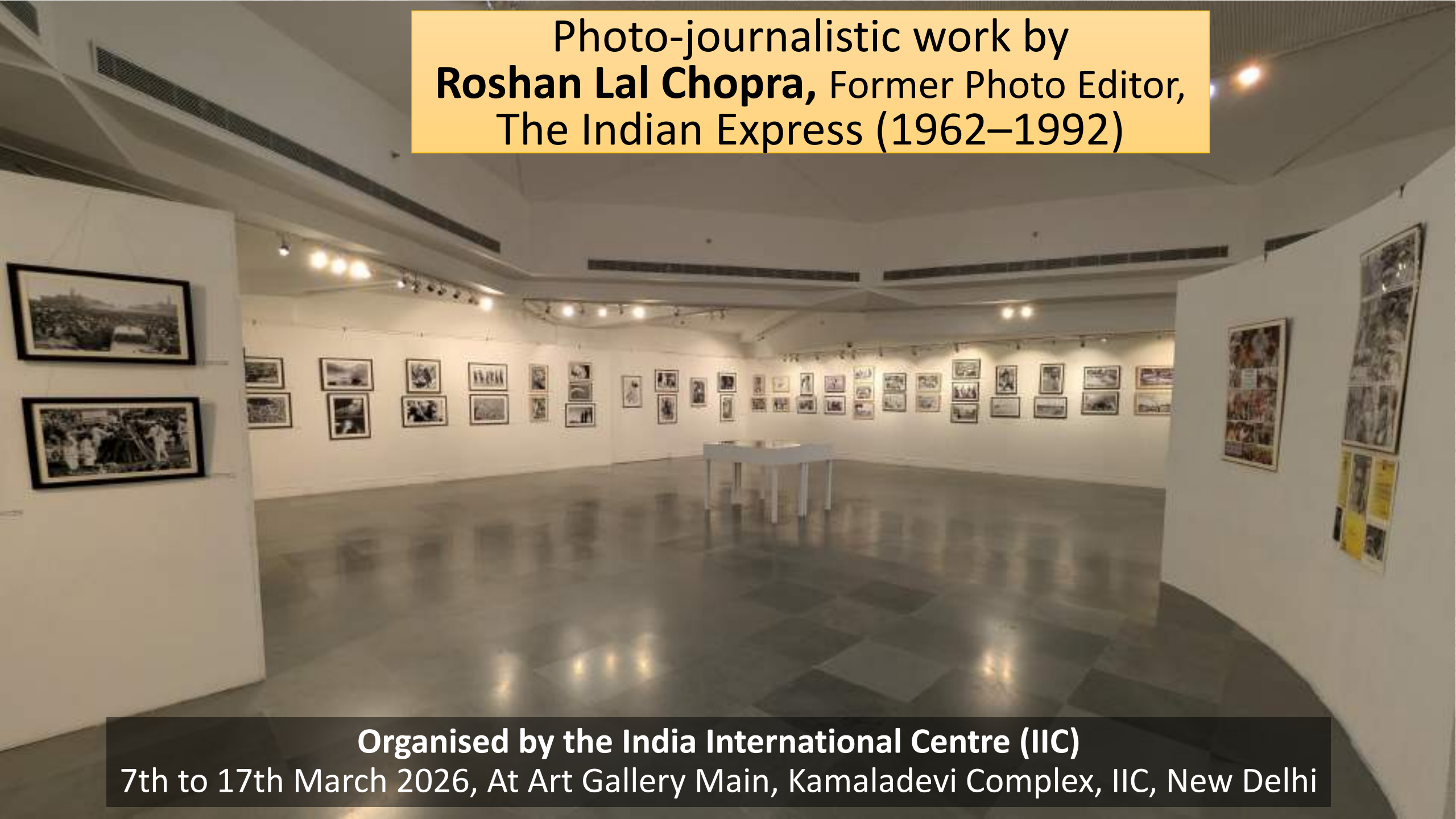
Photo-journalistic work by Roshan Lal Chopra , Former Photo Editor, The Indian Express (1962–1992)

Organised by the India International Centre (IIC) 7th to 17th March 2026, At Art Gallery Main, Kamaladevi Complex, IIC, New Delhi